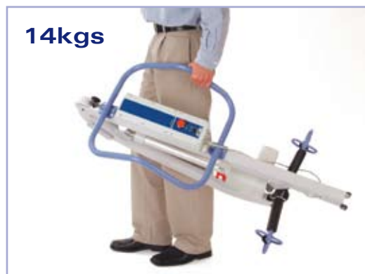
Mast and boom

In addition to outstanding performance, the Advance can also be folded or separated for onward transportation.