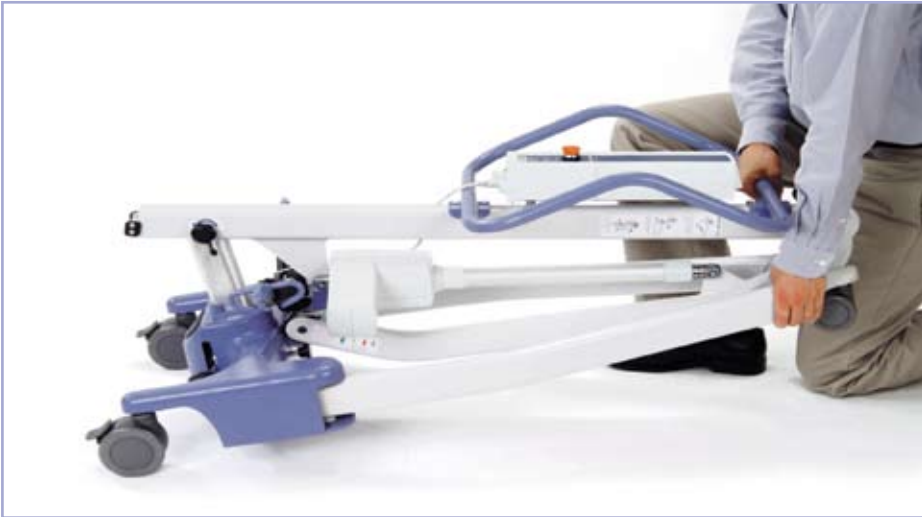
Folded for easy storage

Unlike other products on the market, the Advance needs NO tools or special attachments to achieve its compact folded position. This functionality gives active users the option to travel outside the confines of their own home. Truly bringing a new dimension to mobile patient handling equipment.